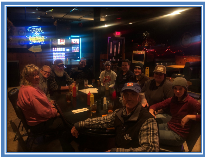
The PAP Crew!

When you first turn your bulls out, watch them and make sure that they are getting the job at hand done. Also, if they start getting a little run down rest them or give them a little extra energy, it will pay dividends in the long run!